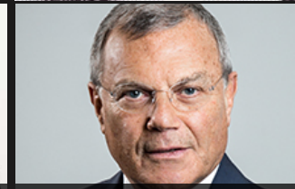
SIR MARTIN SORRELL